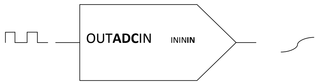
Figure: Analog to digital convertor

Analog to digital convertor- A device that converts continuous voltage to digital number is known as Analog to Digital convertor. The digital output use usually binary coding which is in proportionate to the input current. The ADC is known by its bandwidth and signal. The actual bandwidth of ACD is measure by its sampling rate (accuracy by which ACR can handle noise and error rate).